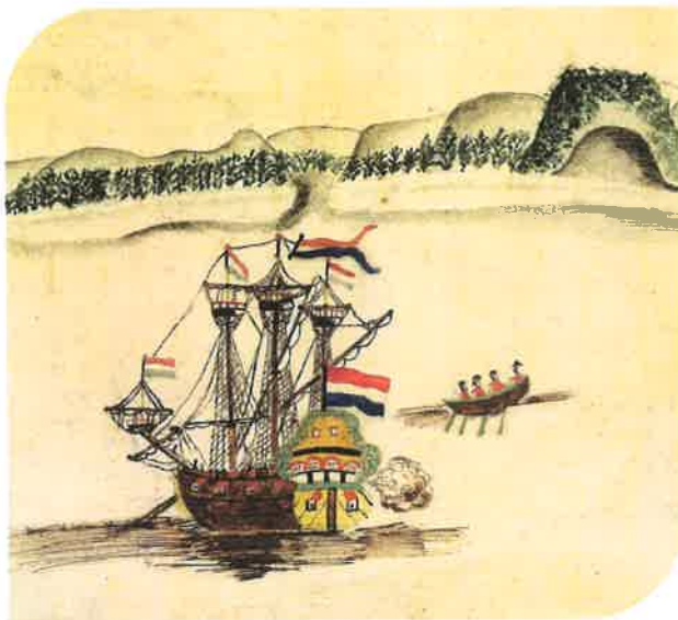
The slave ship 'De Leijdsman' (C2246; also AG17842)

Search your Family name on Google. Useful websites can be traced this way.