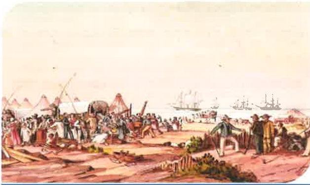
Landing of the British Settlers in 1820 (A 263 No. 54)

Consult inventory 1/42 for volume numbers. These are not passenger lists, but lists of ships and indicating numbers of passengers.