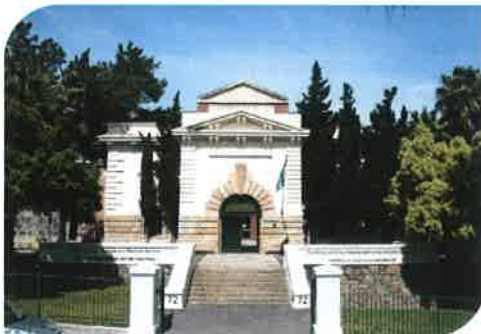
Entrance to the Western Cape Archives and Records Service

To help you plan your visit, we recommend that you contact us in advance to find out when we will be open.