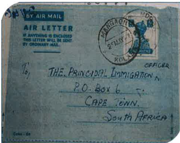
An interesting envelope addressed to the Principal Immigration Officer.