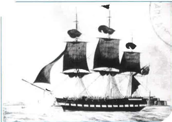
Departure of the Immigration Ship, 'Chapman' (M 390)