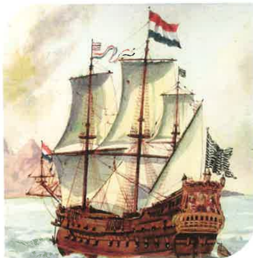
Dutch East Indiaman 'Africa', 17 th century (A 263 No. 142)