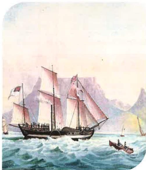
The First steamship (A 263 No. 136)