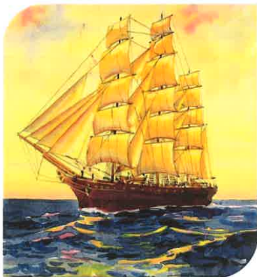
Sailing vessel of about 1850 (A 263 No. 152)